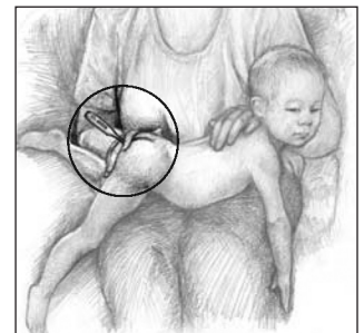
Rectal (in the child's bottom)— belly down