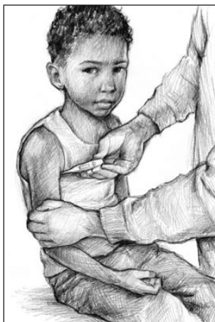
Axillary (under the child's arm)